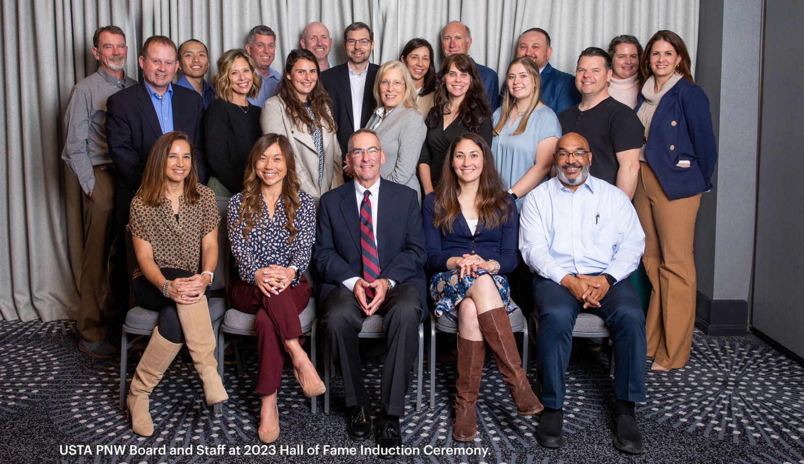
USTA PNW Board and Staff at 2023 Hall of Fame Induction Ceremony.